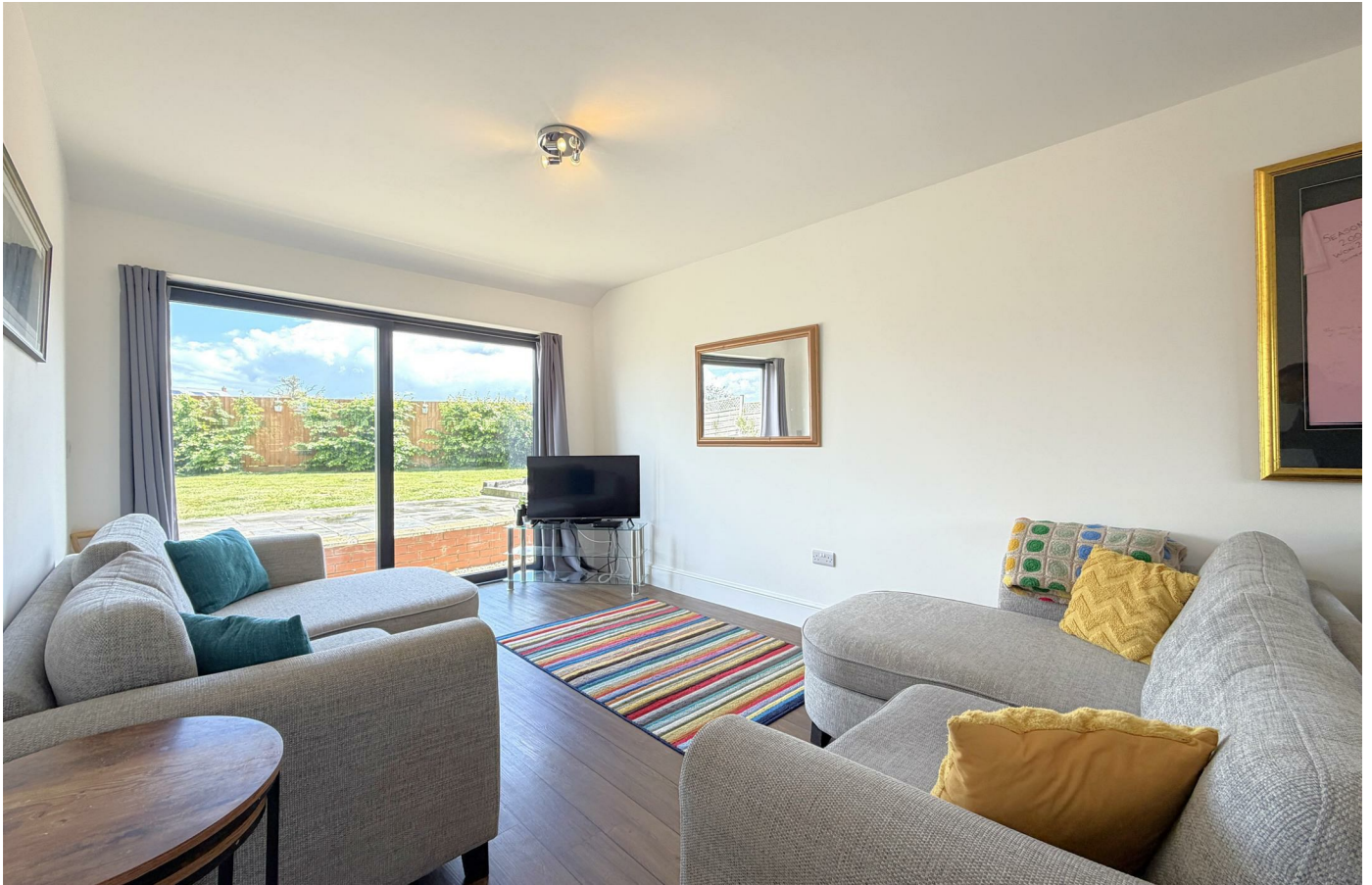
1 Asps Cottages, Banbury Road, Warwick, CV34 6SS